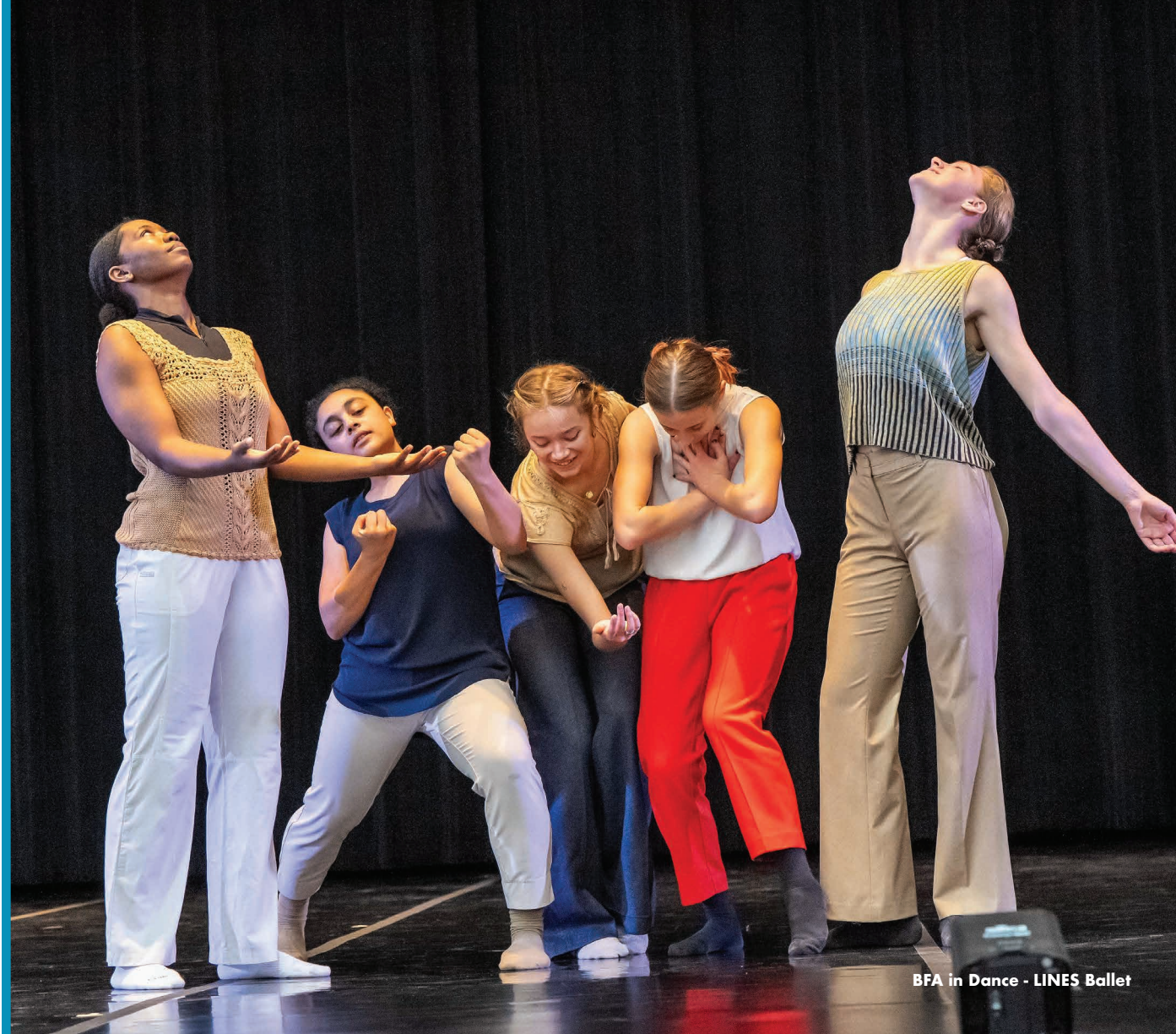
BFA in Dance - LINES Ballet