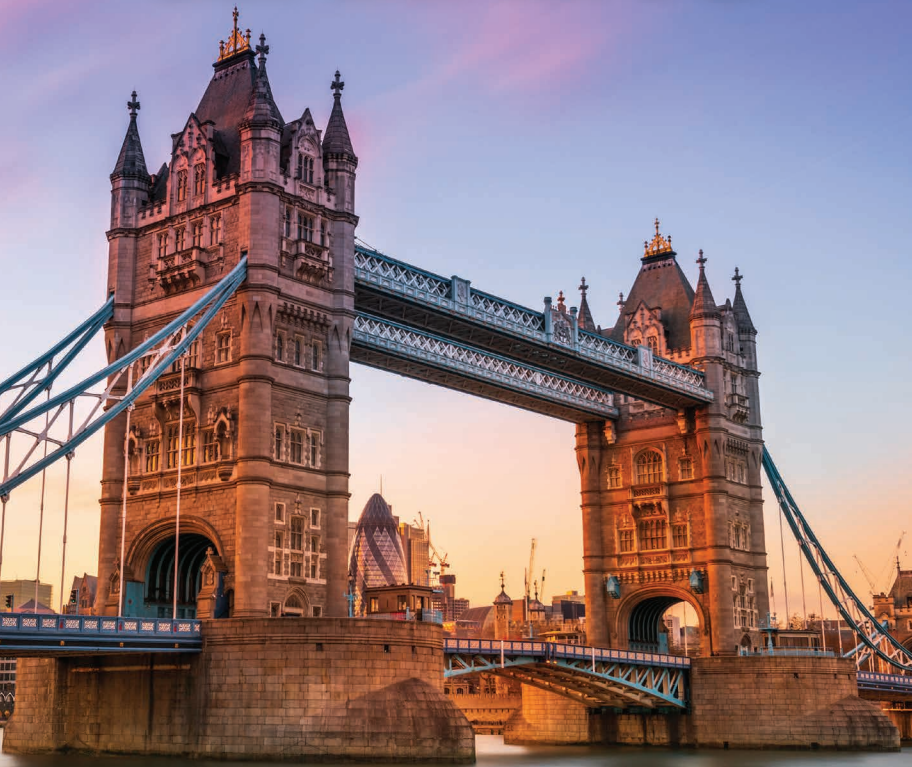
Tower Bridge in London, UK